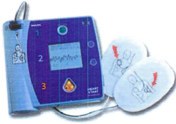
HeartStart FR2+ Defibrillator

Trusted most often by those depended on to save lives