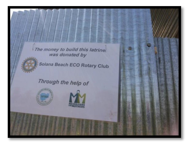
Feb. 3, 2016