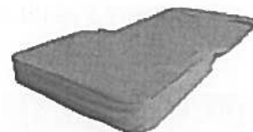
Replacement Cover for Bag Jack™ Floor Chair