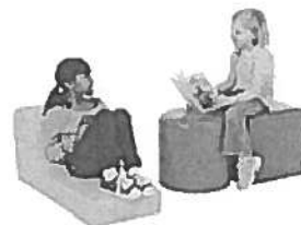
Children's Floor Furniture