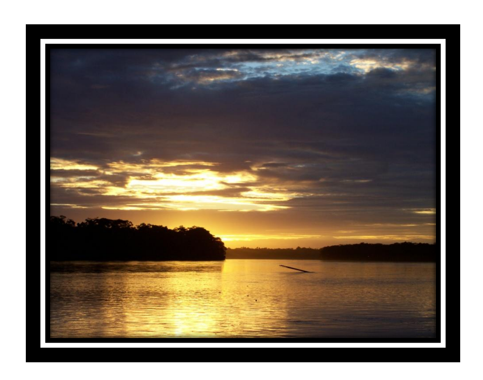
Submitted to: Estes Valley Sunrise Rotary Club

Kutsutkao Village, Achuar Territory, Pastaza Province Ecuador Village Water Purification and Distribution Project - GG2572915